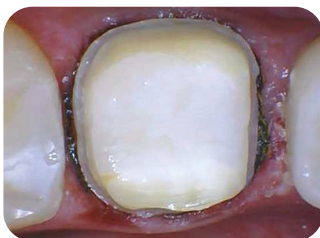
Core build-up using Stela composite